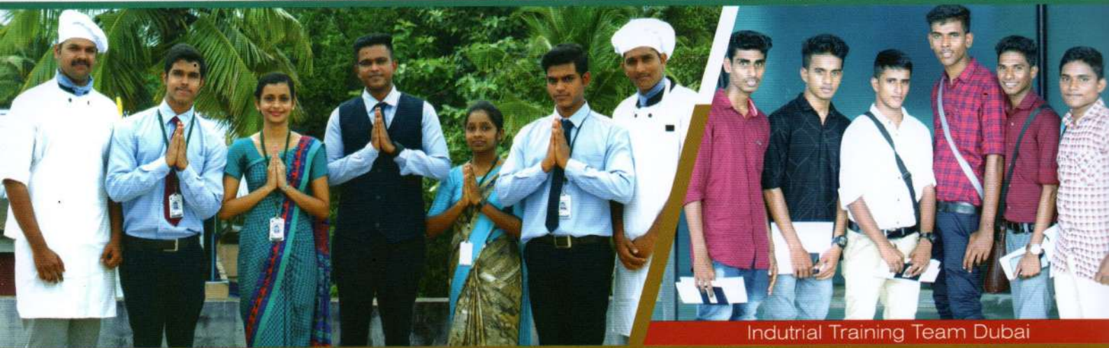
Industrial Training Team Dubai